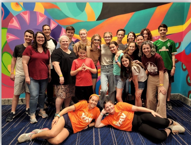
LCMS Missionary group photo