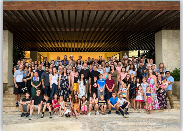
LAC group photo at Regional Conference